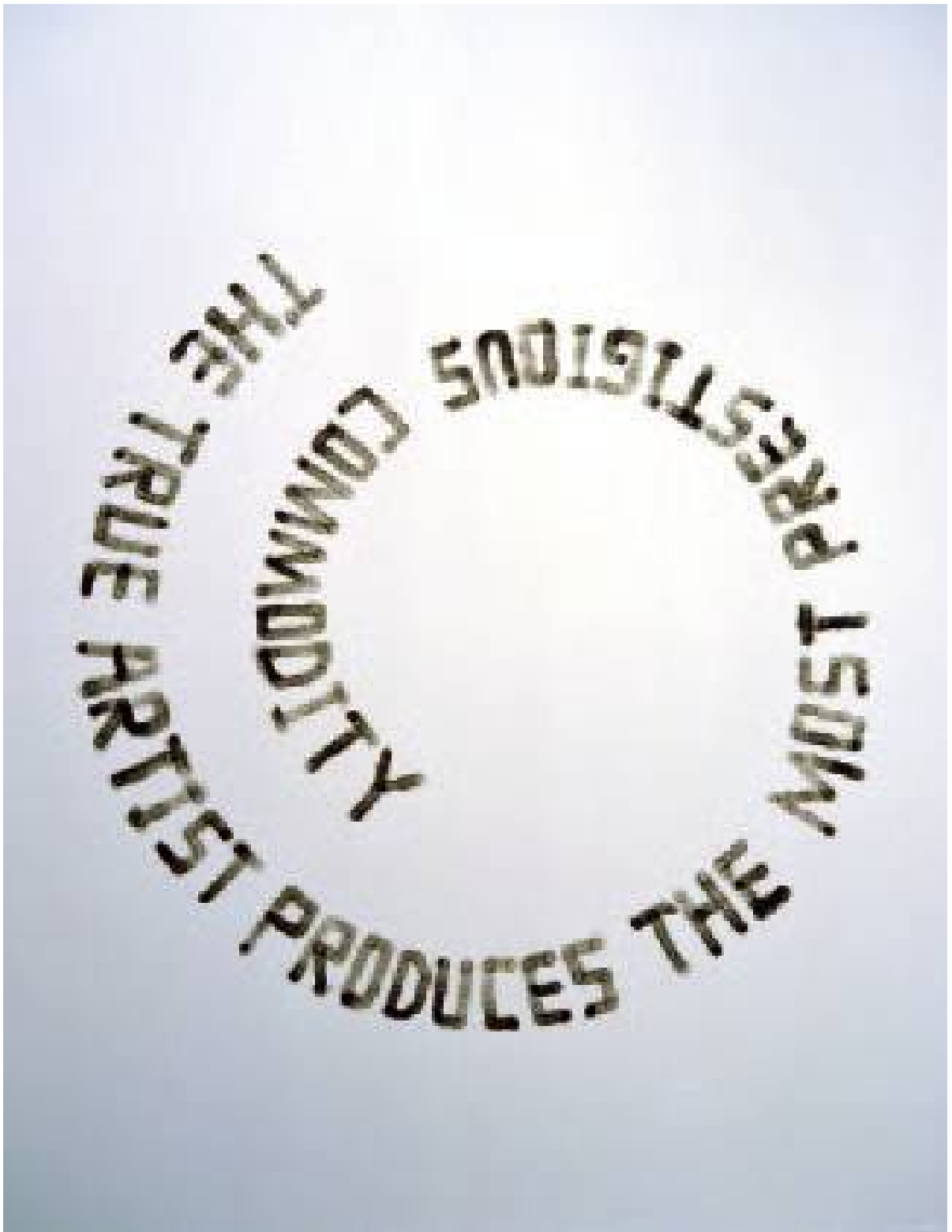
Claire Fontaine, The True Artist (spiral version), 2004, smoke on ceiling, 150 × 150cm. Courtesy the artist, Air de Paris and Chantal Crousel, Paris