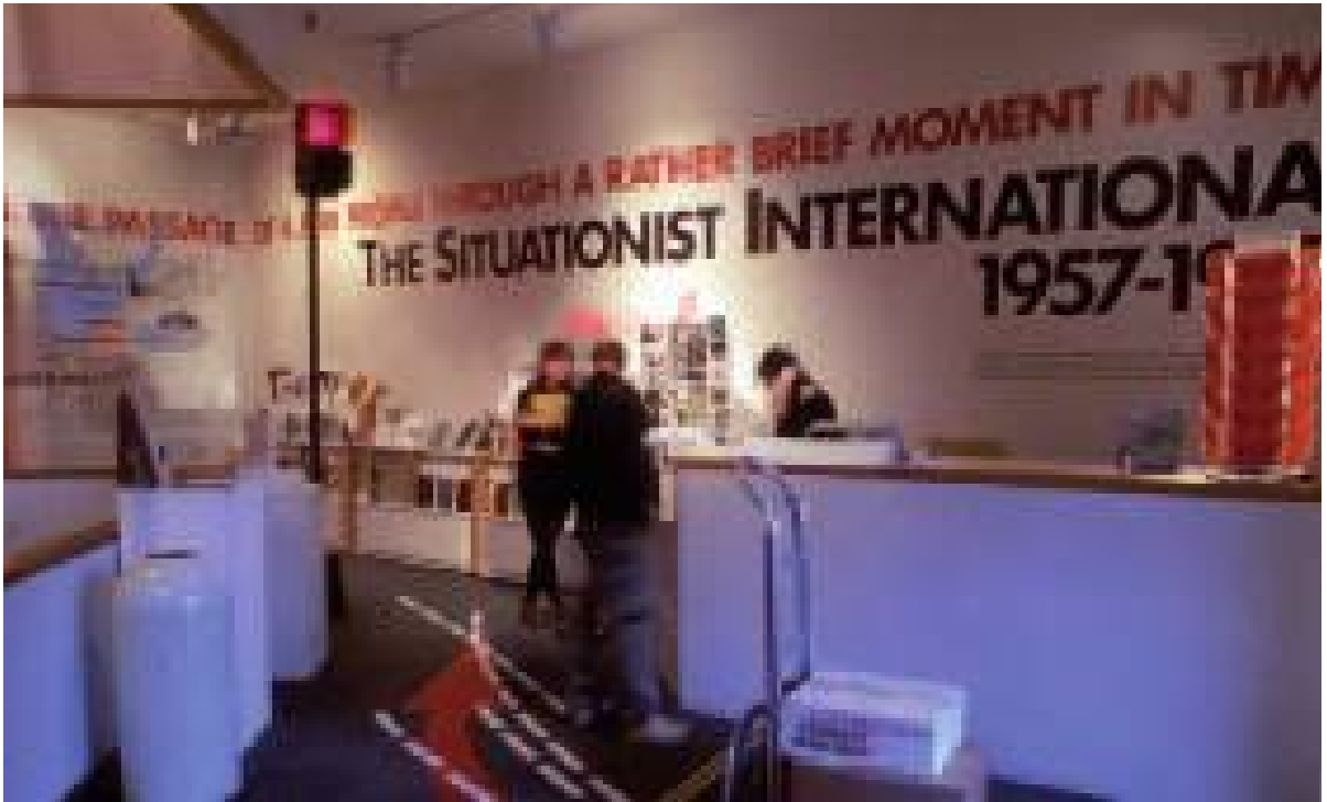
Above and left: Installation views, 'on the Passage of a few people through a rather brief moment in time — The Situationist International, 1957—1972', Institute of Contemporary Art, Boston, 1989.

The logic of the commodity, which operates within its own protocols of devaluation and fragmentation, reasserts its prerogatives over a practice that had intended to be its negation. To speak of recuperation seems banal; it would be rather more accurate to say that the historic wager of détournement was deferred. If Debord, in publishing his Comments , was seen as somehow coming too late, as being an obscure voice from a past long forgotten ( Le Monde's review was tellingly accompanied by a photograph of the author that was thirty years old), the Beaubourg exhibition could be said to have come too soon, anticipating a legacy that did not yet exist. Both were received at the moment of a triumphant postmodernism, whether in the arts or in the sense of an era that understood itself to be post-historical; as such, they were both destined to misrecognition.